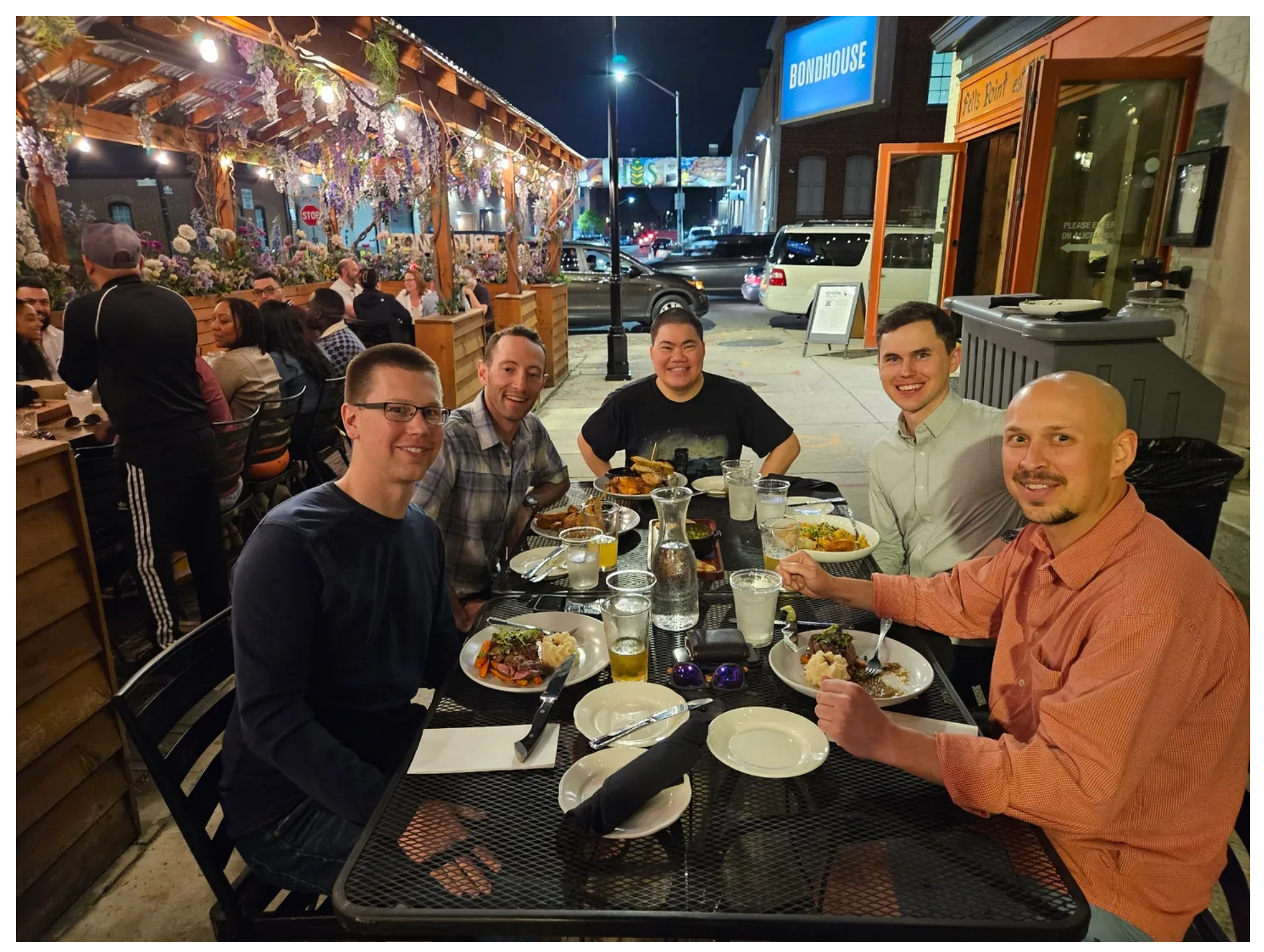
Met up with old friends in Baltimore

In addition to the traveling and visits with friends and family, I feel that my confidence with Korean has jumped quite a bit this month! Actually using Korean in Korea and being understood felt so great and I have a newfound drive to study harder and speak more and more. In addition, I did a few practice Oral Proficiency Interview tests with several instructors and I notice improvement each time.