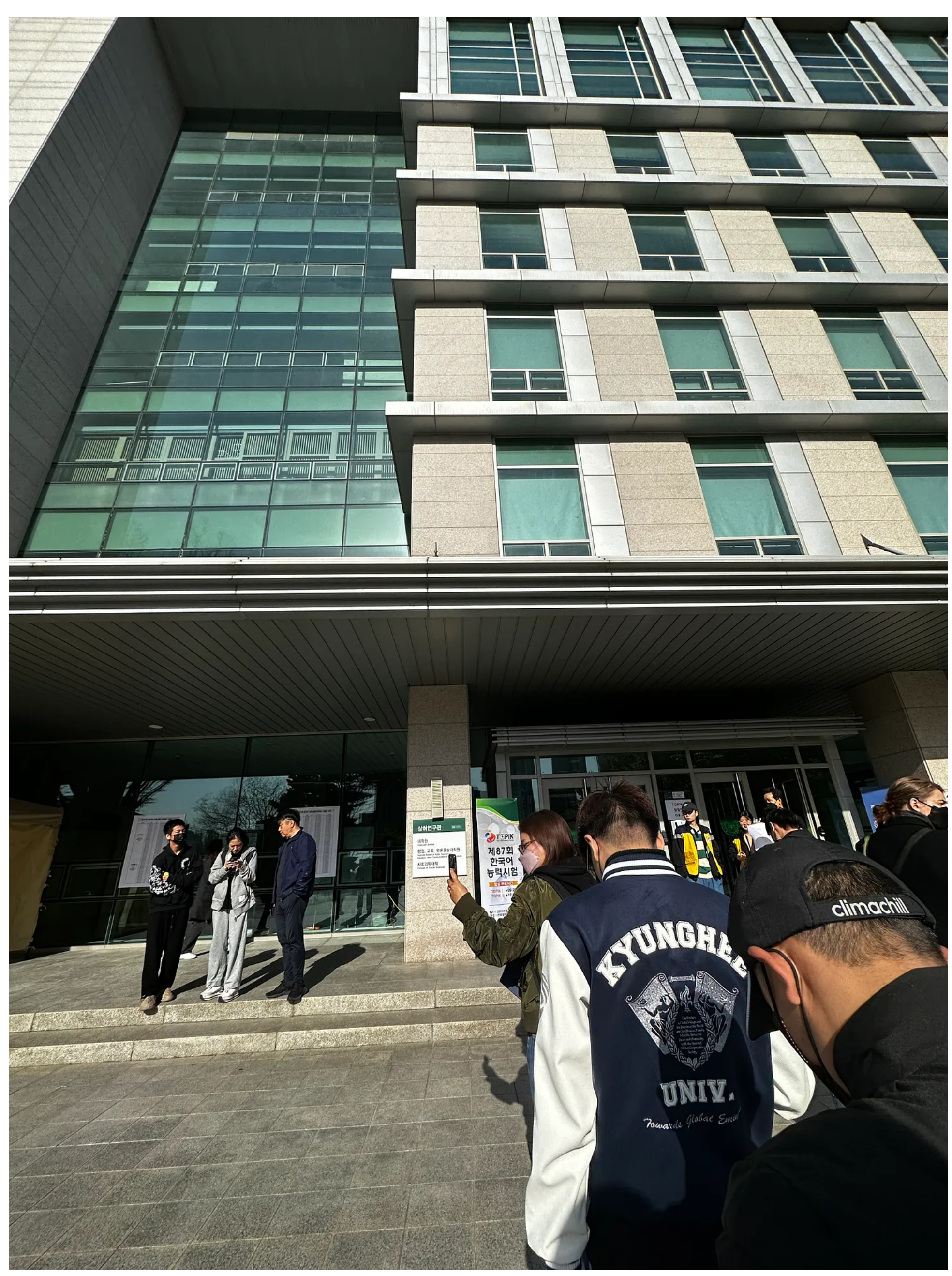
Waiting in line for the TOPIK test

While in Seoul, I also took the TOPIK (Test of Proficiency In Korean) exam. The more advanced TOPIK II test filled up quickly while I was having trouble registering for the test a few months ago, so I had to take the easier TOPIK I exam. It was a very easy test, but I'm glad I took it for the logistics alone. Following test proctor instructions was much more difficult than the actual test, and I learned a few valuable lessons for when I take the TOPIK II and my score actually matters. It was quite strange being in a test room full of many different nationalities taking a beginner Korean test while test proctors give important instructions in fast Korean. Thankfully I was able to understand, but I can imagine if I was at the stage where the test was difficult, I would have no idea what was going on. The harder version of the test includes an SAT style essay, so once I'm in Korea, I plan on hiring a tutor to help me with writing Korean essays because that is the only scary part of the test for me.