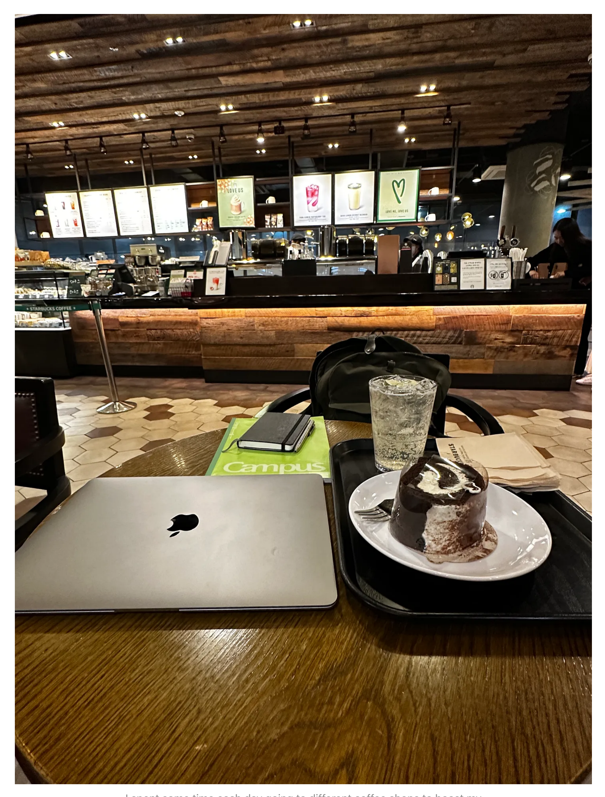
I spent some time each day going to different coffee shops to boost my confidence ordering things in Korean and to listen to all the customers. This was quite helpful!