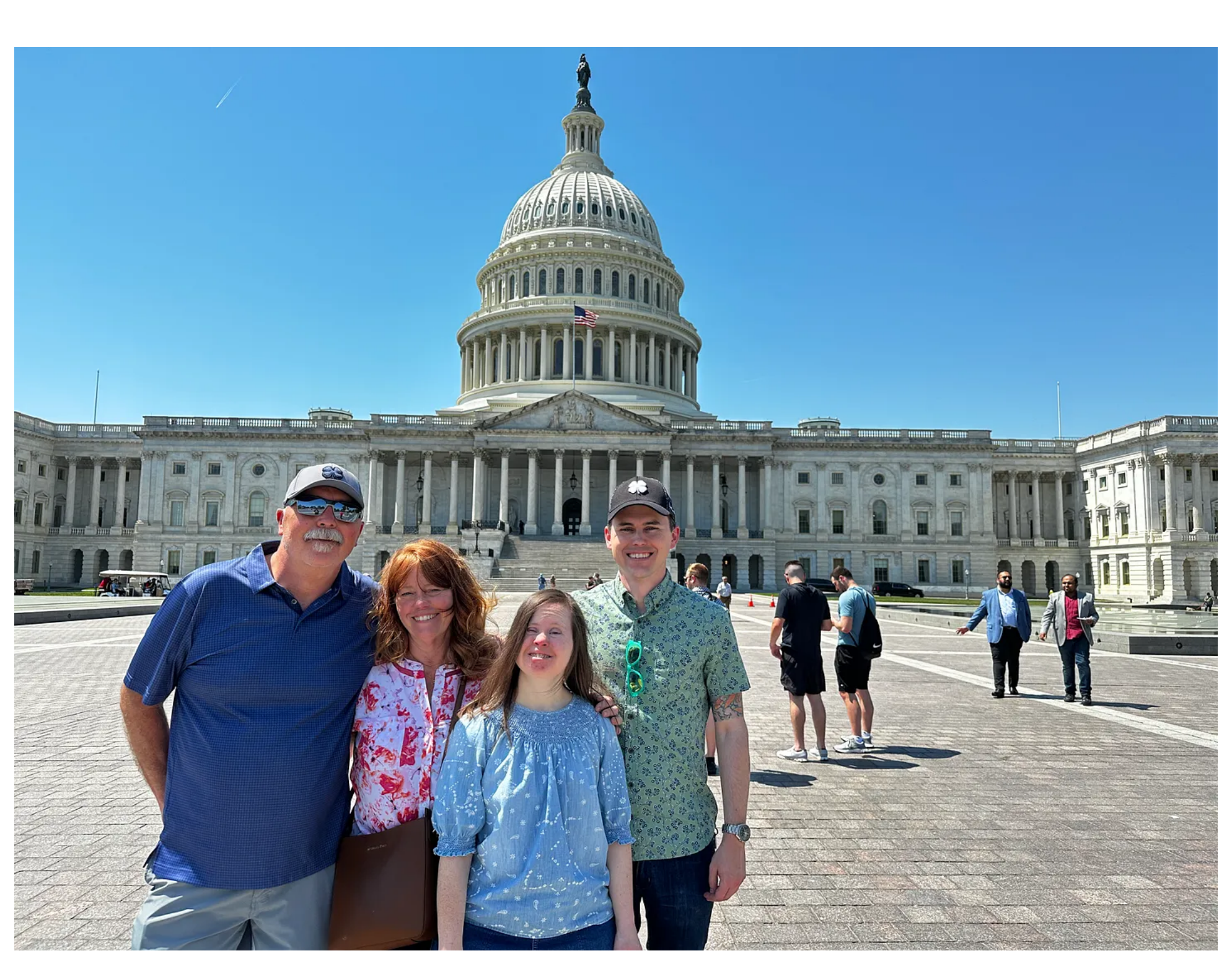
Touristy things with my family!