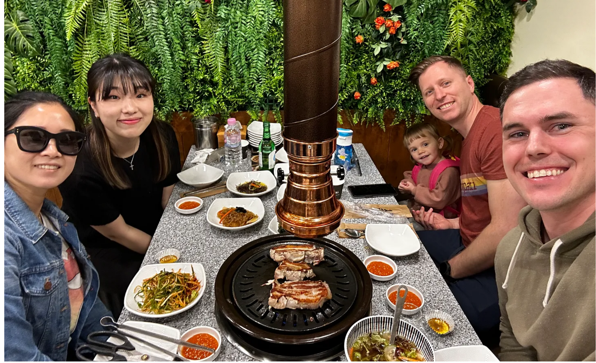
I met up with some old friends in Hongdae and had a wonderful day!!