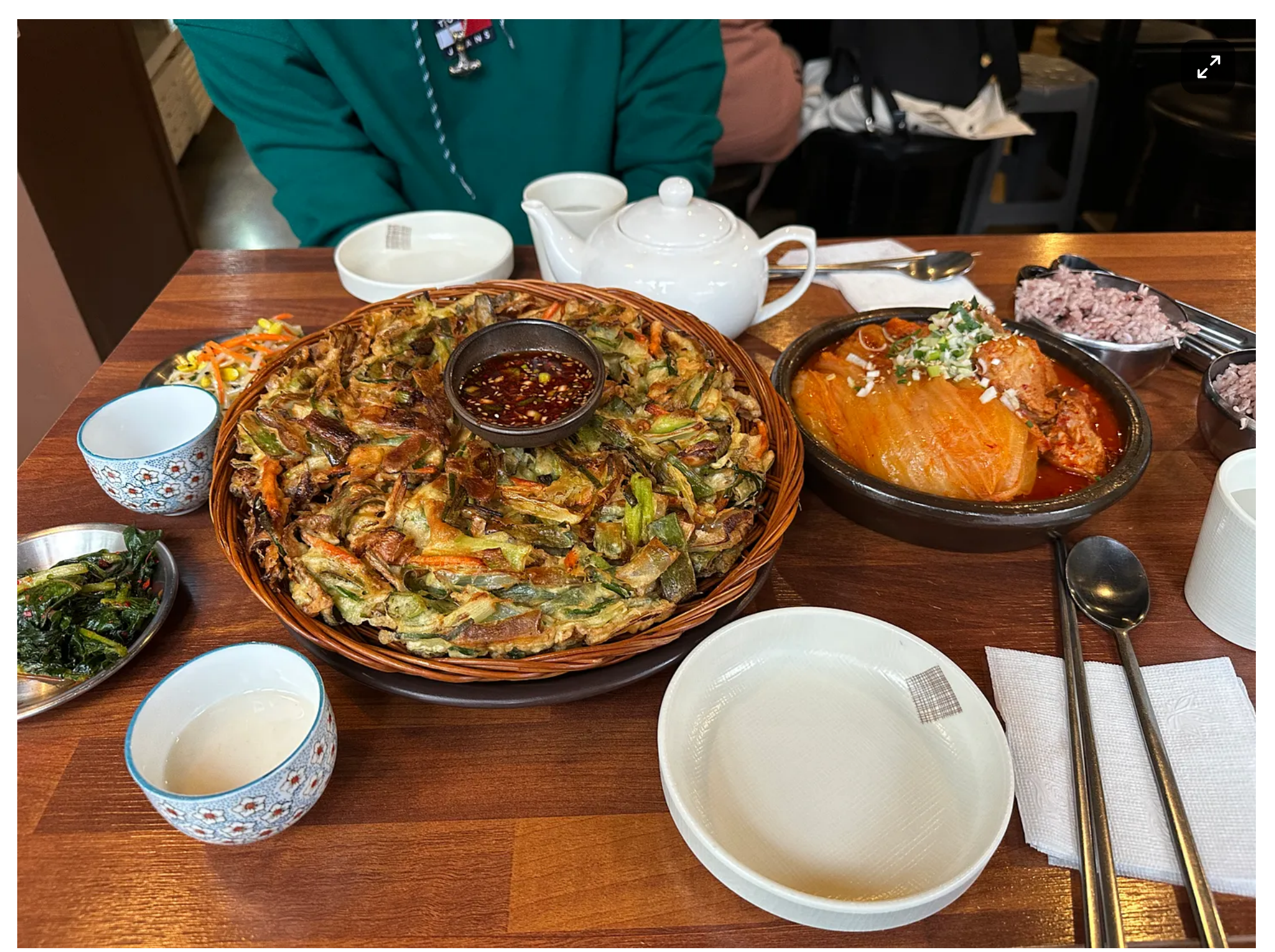
Turns out these onion pancakes are my favorite thing...