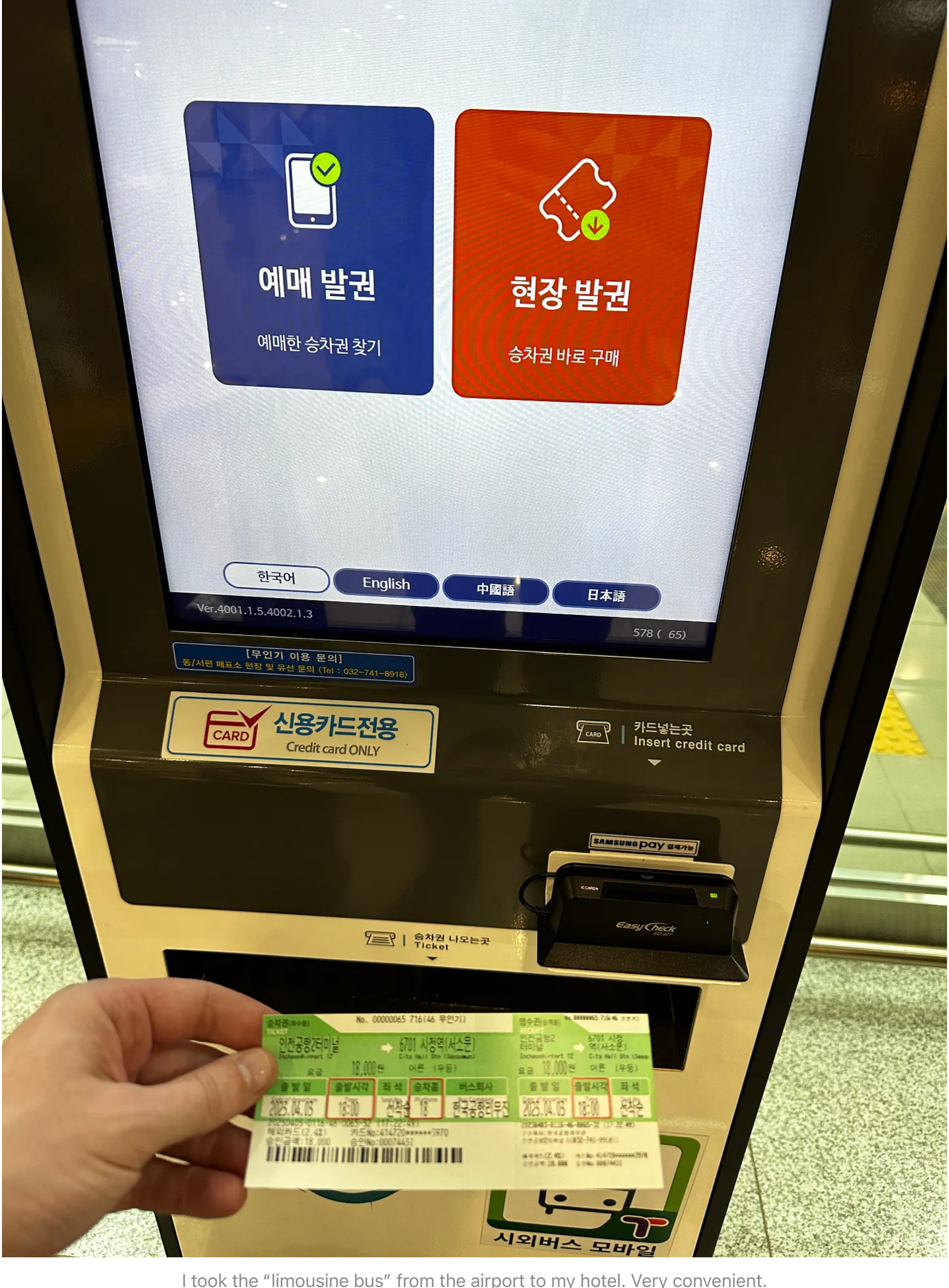
I took the "limousine bus" from the airport to my hotel. Very convenient.

April was an incredible month for me, both in Seoul and here in the US. Instead of boring you with a journal of this month's adventures, I'll just post a few key pictures (mostly of food) and captions below!