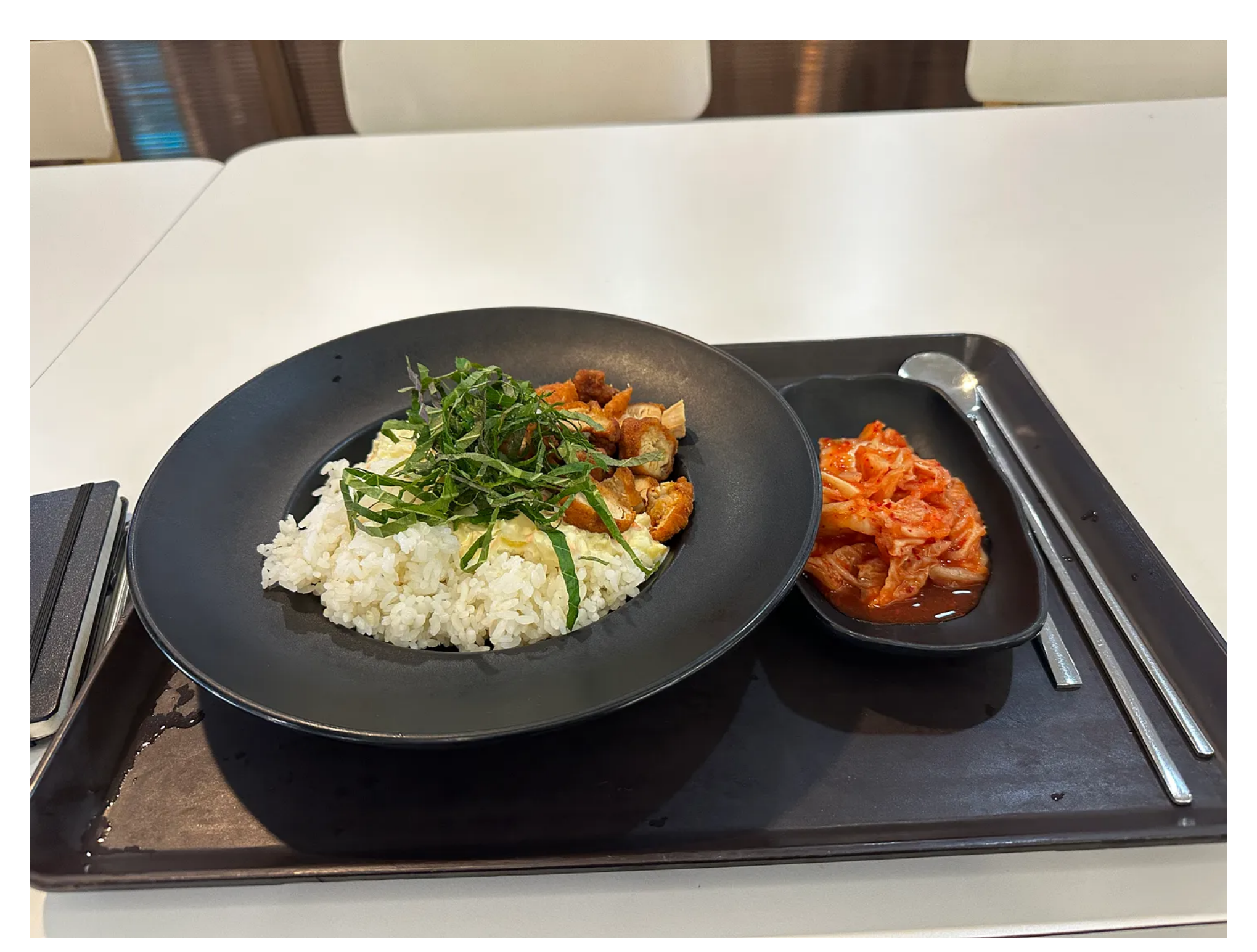
I ate lunch at the Yonsei cafeteria and noticed so many interesting cultural differences during this one short experience.

I toured all of the graduate schools I'm interested in and think I settled on Yonsei University?